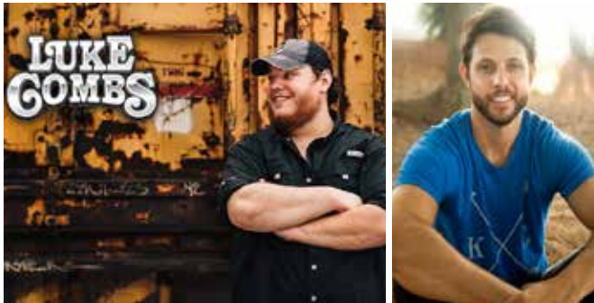
7:00p Luke Combs with special guest Ray Fulcher