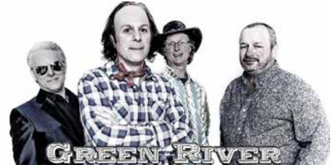
7:00p The Green River