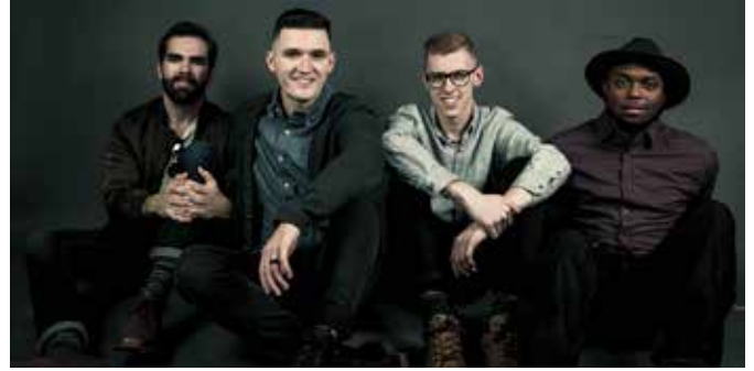
6:45p Relinquish (Opening Act)