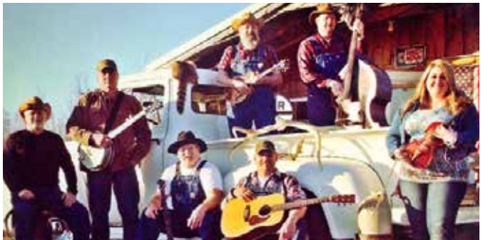
7:00p & 9:00p The Less Boys & More

2018 Union County West End Fair - August 5-11, 2018!