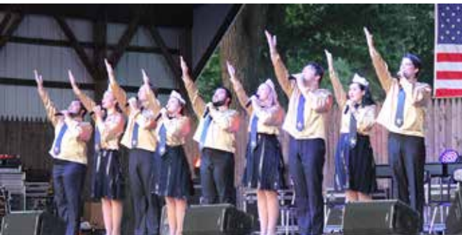
7:00p & 8:30p Re-Creation