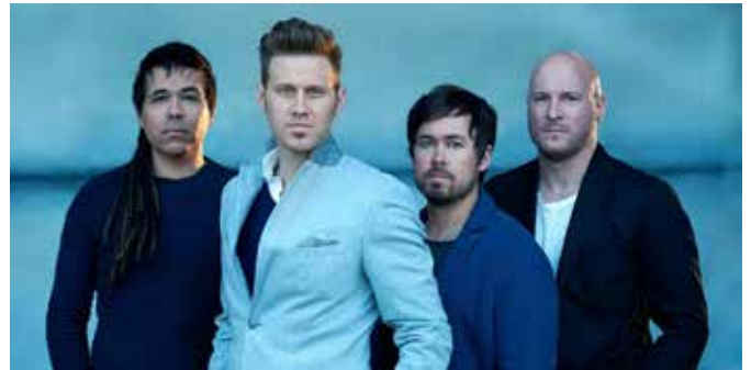
7:30p Building 429