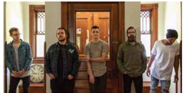
8:00p - Relinquish