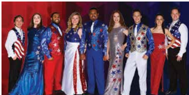
7:00p & 8:15p Re-Creation USA