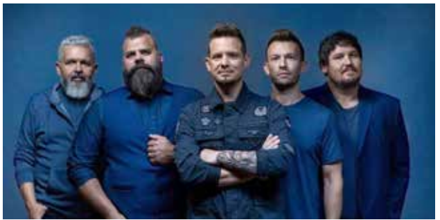
8:00p - Unspoken with Special Guests Bonray